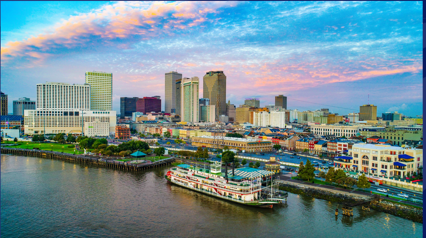
Exhibit & Sponsorship Prospectus

February 5-7, 2024 New Orleans Marriott | New Orleans, LA Visit aacnnursing.org/diversity-symposium to learn more.