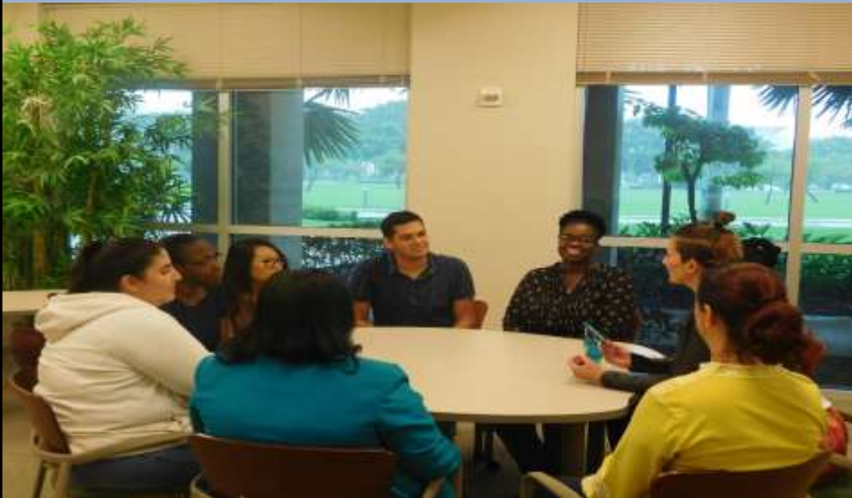
Christine E. Lynn College of Nursing

○ IN THINKING ABOUT HEALTH EQUITY, WHAT MATTERS THE MOST TO YOU?