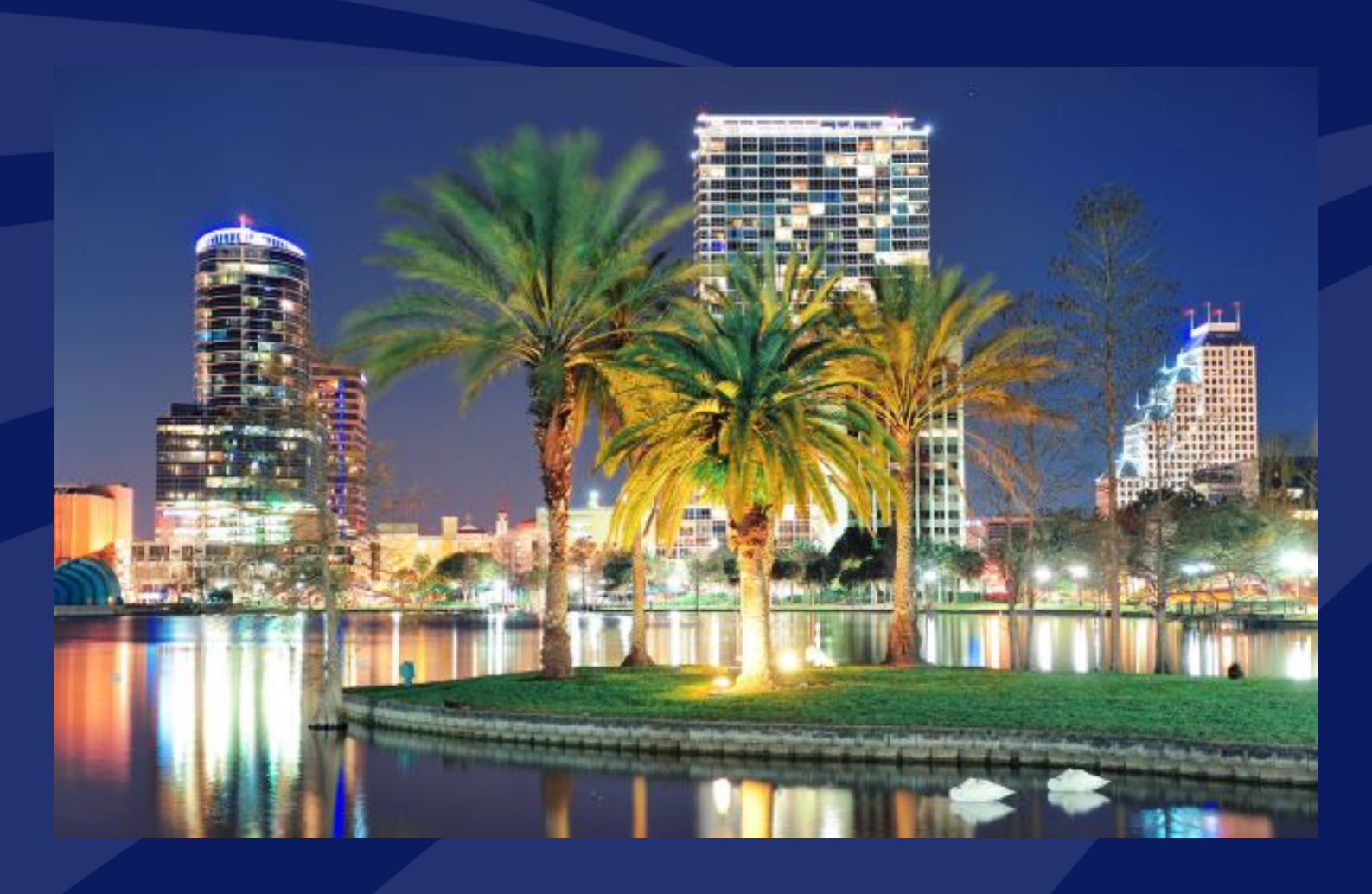
Exhibit & Sponsorship Prospectus

November 30-December 2, 2023 Hilton Orlando Buena Vista Palace Lake Buena Vista, FL Visit www.aacnnursing.org/transform to learn more.