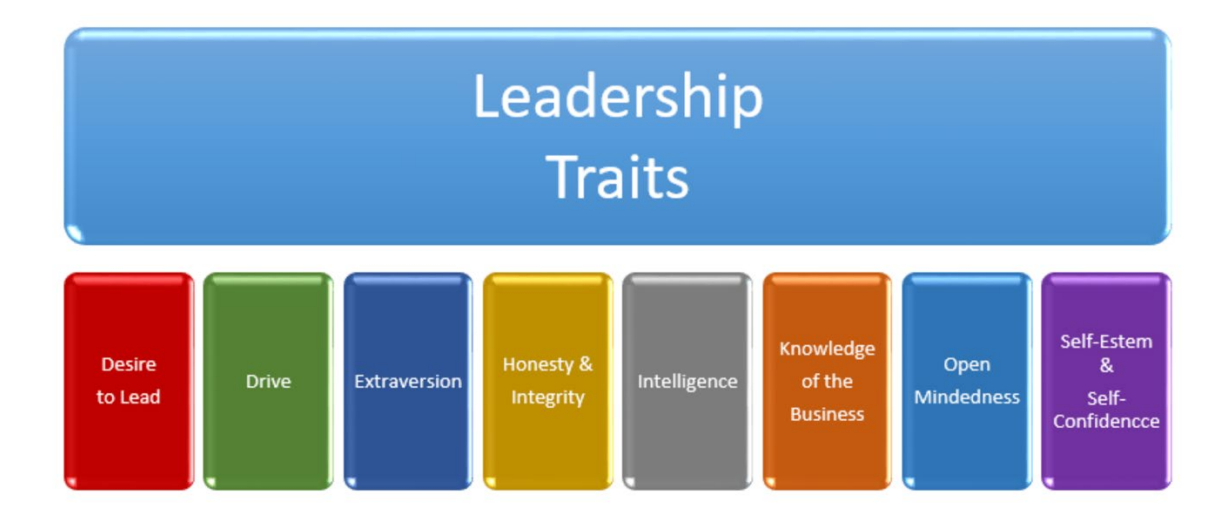
Figure 1. Melander and Douglass Leadership Traits