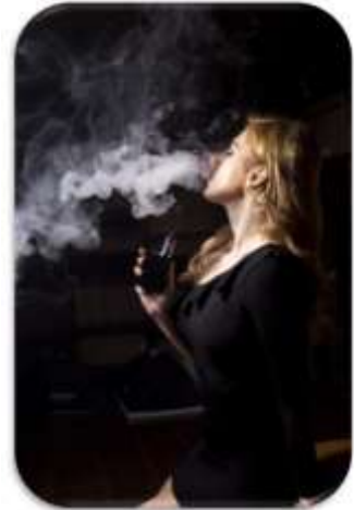
Royalty-free vaping photos